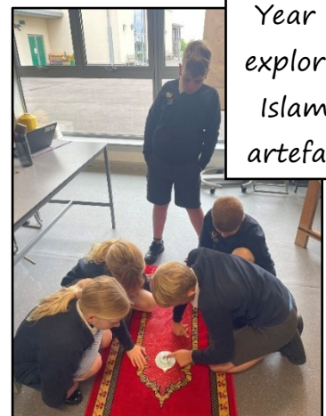
Lancelot Year 5s exploring Islamic artefacts

Congratulations to Blackdowns House who by topping the house point chart last half-term enjoyed a MUFTi day today – with plenty of activity set for the summer term, the race is on to see who will be the next house winners!