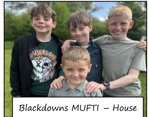
Blackdowns MUFTI – House winners Spring Term

I hope that all enjoyed a restorative break and enjoyed that wonderful first week of sunshine! Already, it is clear all are eagerly anticipating the delights of the Summer Term and all which lies ahead. Curriculum letters outlining the class topics this term will be published on the website and emailed to parents next week.