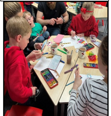
Forces-families egg decorations