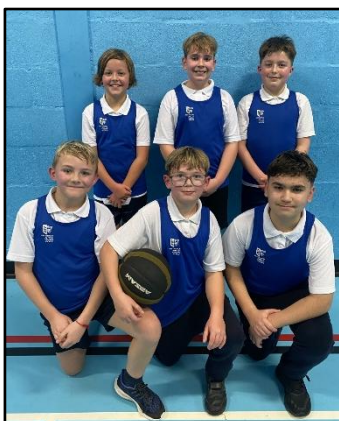
Basketball at Bucklers' Mead